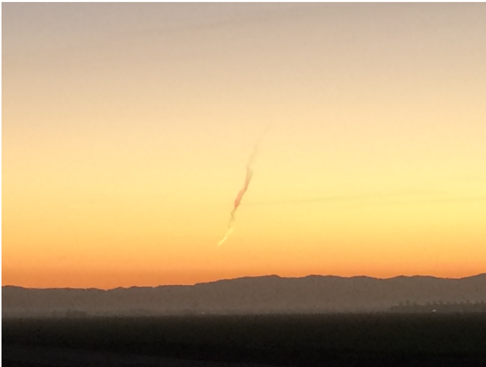
Flame traveled east, 30 minutes later 1