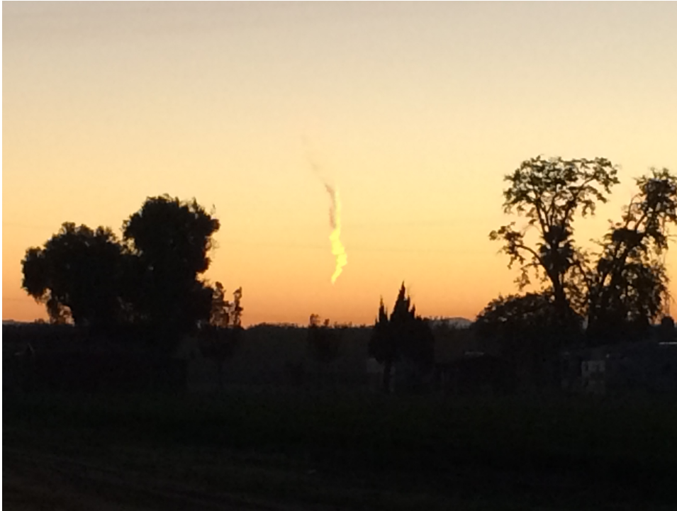
Flame on prayer drive, November, 2014 1